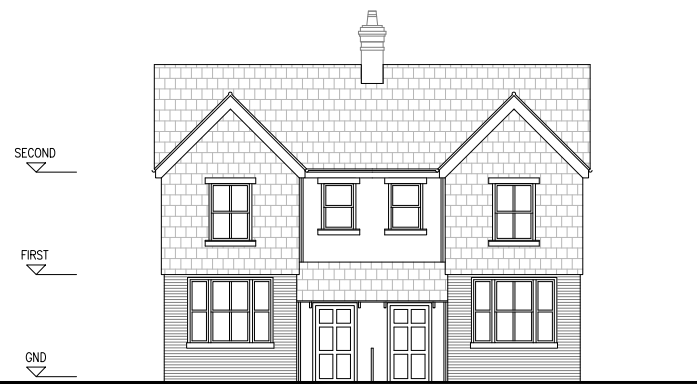
PRIVATE/ AFFORDABLE UNIT TYPE 03 - VARIATION A 102SQM/ 1,100SQFT GIA