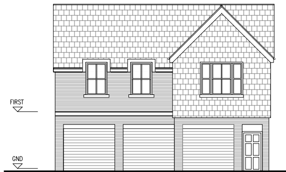
AFFORDABLE UNIT TYPE 05 - VARIATION B 50SQM/ 540SQFT GIA