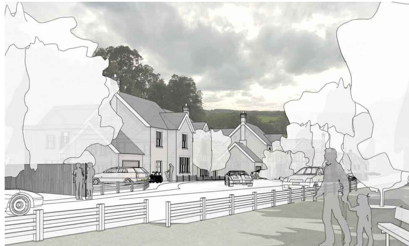
VIEW FROM WATERBURY HILL LOOKING NORTH WEST ONTO THE EXISTING SITE ACCESS