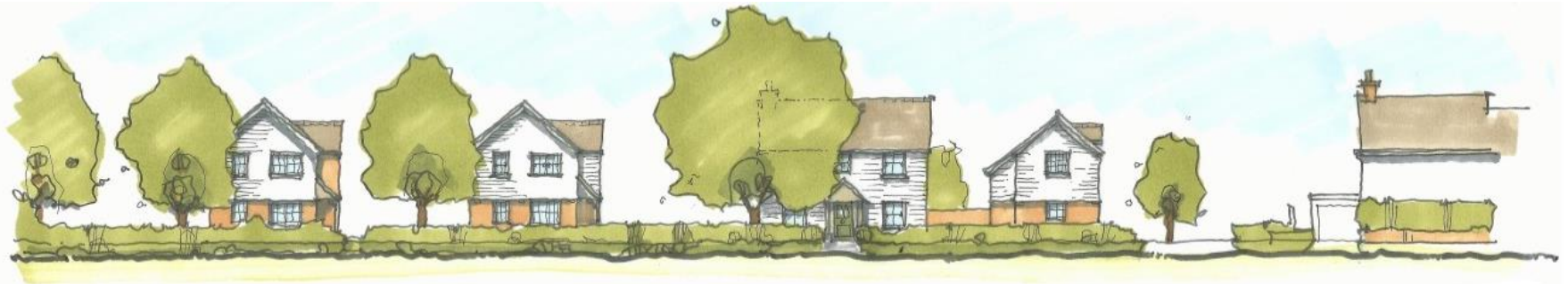
View from internal road looking south